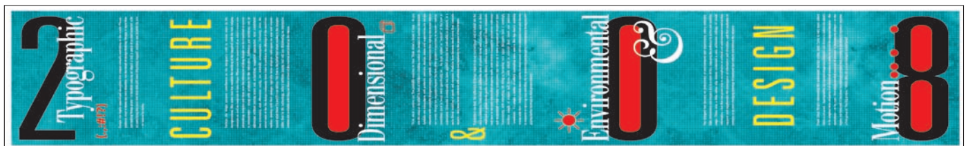
8.5" x 48" Banner